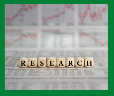
risk as well as the effect that tobacco use has on sustainable development. Successful researchers will be notified next quarter.

grant to implement research that aligns with the CTCA Tobacco Control Research (TCRA) Agenda. The aim of the agenda is to generate local evidence to drive tobacco control policy formulation and implementation in Africa. Of the eight thematic areas in the research agenda, the most popular were tobacco use and populations at